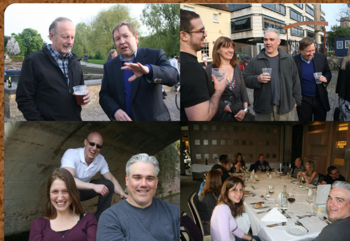
Cambridge 2009. Great trip!